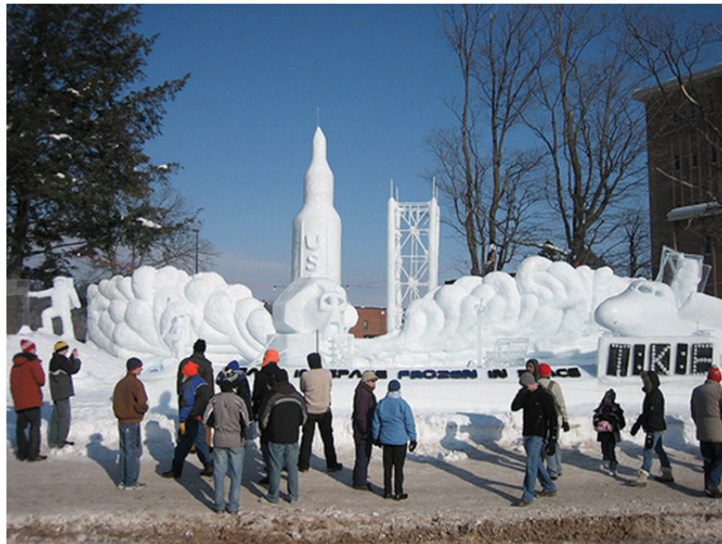
One of many sculptures erected by Michigan Tech Students modeling the weapons the Nerd Nation plans to use for World Domination. Mass production of these weapons should begin around January of this coming year. As well as copious amounts of Win.

us r3l4y1ng th3 f0ll0w1ng m3ss4g3, wh1ch h4d b33n sent by the higher ups of the Nerd Empire to their loyal followers: "Our pl4ns f0r d0m1n4t10n 4r3 st1ll On tr4ck, w3 w4nt 3v3ry0n3 t0 kn0w th4t th3 thr34ts 4g41nst us by th3 Pr3s1d3nt 4nd 0th3r 4m3r1c4n 4uth0r1t13s 4r3 s1mply c0v3r st0r13s. L3t 1t b3 h34rd th3 Pr3s1d3nt 0b4m4, 4nd m0st Of h1s st4ff, 4r3 4lr34dy str0ng supp0rt3rs Of Our m0v3m3nt. 4nd 1t 1s 4ls0 t0 b3 kn0wn th4t Pr3s1d3nt 0b4m4 1s N3rd1sh, 4nd n0t th3 rum0r3d Mus1m." ☺